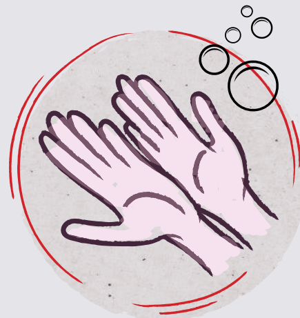
Rinse hands with warm water