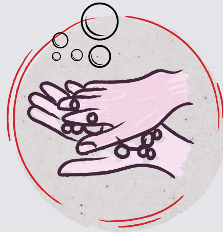
Rub between fingers