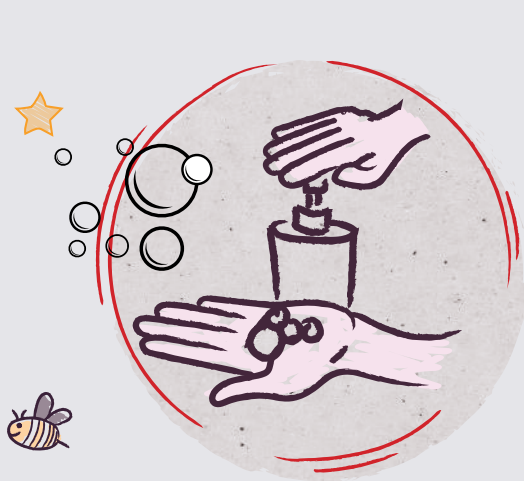
Wash hands with warm water and soap