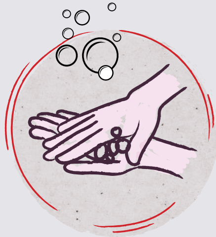
Rub hands palm to palm