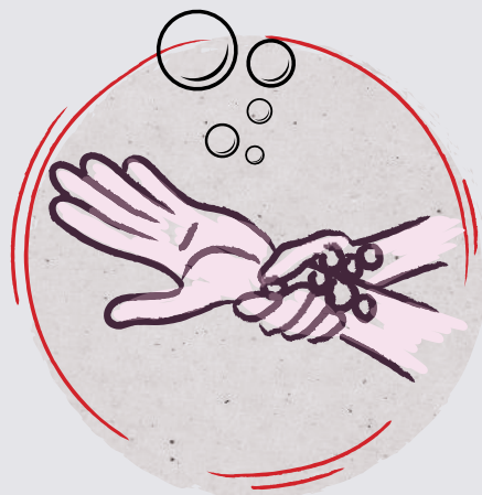
Focus on your wrists